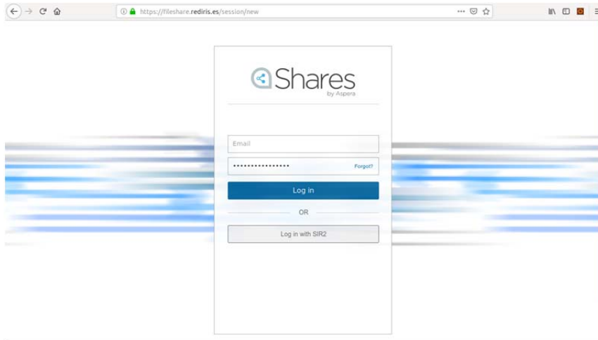
Fig6. Aspera Client login page for genomic data transfer to CNAG for processing.

Finally, once Step3- (Upload data) has been satisfactorily completed and the “submit” button clicked, users are sent, via email, the login credentials for the genomic data transfer, which is done through Aspera (Fig6). Once the transfer has been completed, data processing is initiated and the resulting data subsequently released to the RD-Connect GPAP where it is ready for analysis by Solve-RD partners and the Data Analysis Task Force.